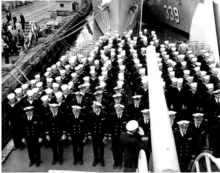
USS Laffey Recommissioning Ceremony January 26, 1951 San Diego, California

The Korean War began on 25 June 1950 when North Korea invaded South Korea. It ended unofficially on 27 July 1953 in an armistice. USS Laffey DD-724 supported US Navy operations in the war. See https://www.laffey.org/HomePage/DD724ColdWar.html .