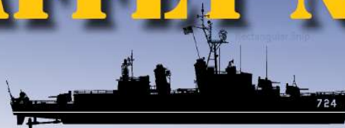
USS LAFFEY, DD724 & DD459 THE SHIP THAT WOULD NOT DIE

Dedicated to those who served in battle and those who pre-served in peace.