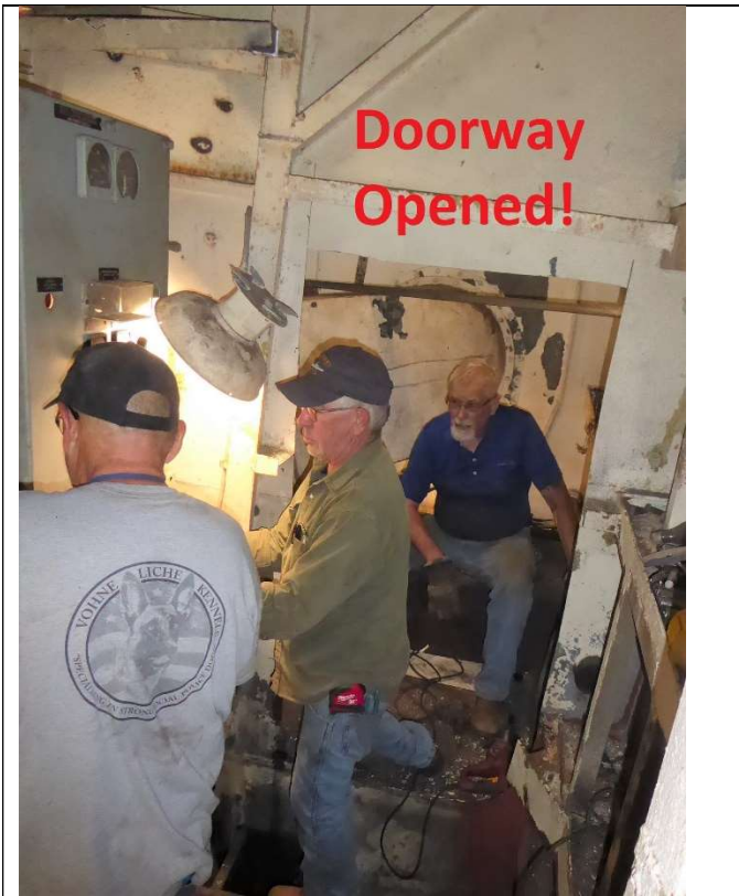
After Doorway Cut Out