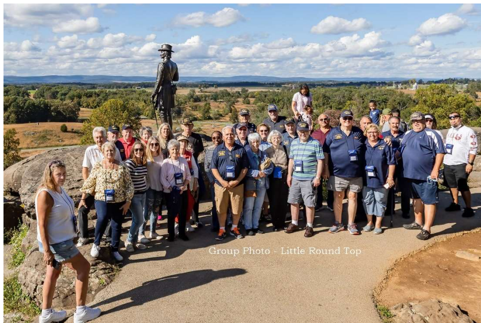
USS Laffey 2021 Reunion – Little Round Top

FIRST CLASS US POSTAGE PAID ALEXANDRIA, VA PERMIT#565