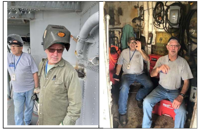
For additional photos see: https://photos.app.goo.gl/qYXHKA1CDu8LK1EB6