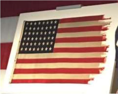
USS Laffey D-Day Flag at Patriots Point Naval & Maritime Museum