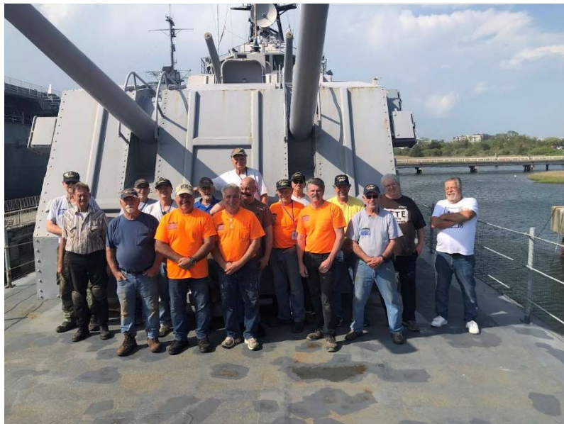
USS Laffey April Work Party

FIRST CLASS US POSTAGE PAID ALEXANDRIA, VA PERMIT#565