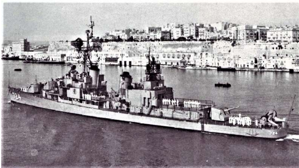
USS Laffey in Malta – June 1969

FIRST CLASS US POSTAGE PAID ALEXANDRIA, VA PERMIT#565