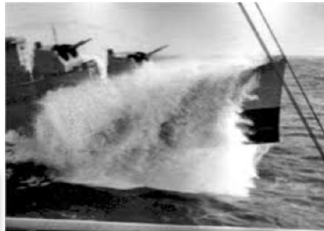
Heavy seas, like the old days on the Laffey

Category 2 Hurricane Dorian passed close to USS Laffey on September fifth without any reported damage. Patriots Point Naval and Maritime Museum