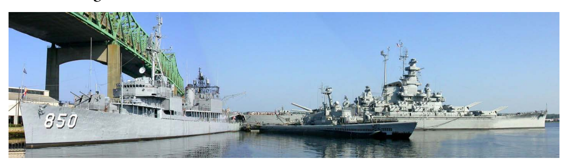
Battleship Cove and Maritime Museum, Fall River, MA