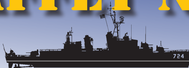
USS LAFFEY, DD724 & DD459 THE SHIP THAT WOULD NOT DIE

Dedicated to those who served in battle and those who preserved in peace.