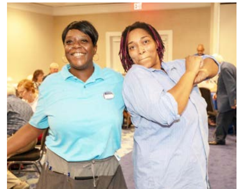
Everybody had a good time including ladies from the hotel staff