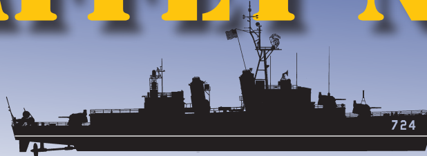
USS LAFFEY, DD724 & DD459 THE SHIP THAT WOULD NOT DIE

Dedicated to those who served in battle and those who pre-served in peace.