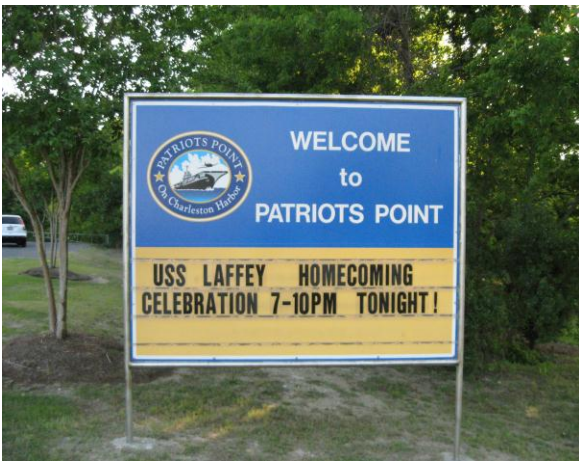
Welcome sign for the evening celebration