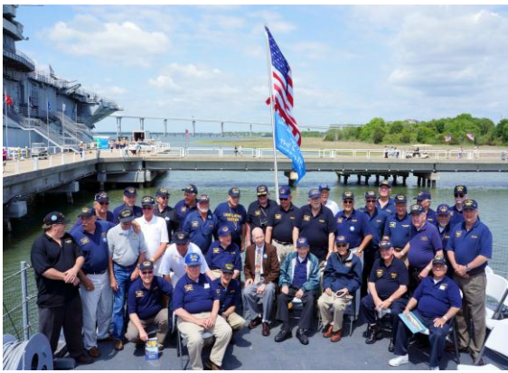
Laffey group photo on the fantail