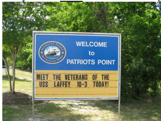
Saturday duty for on hand Laffey Crew