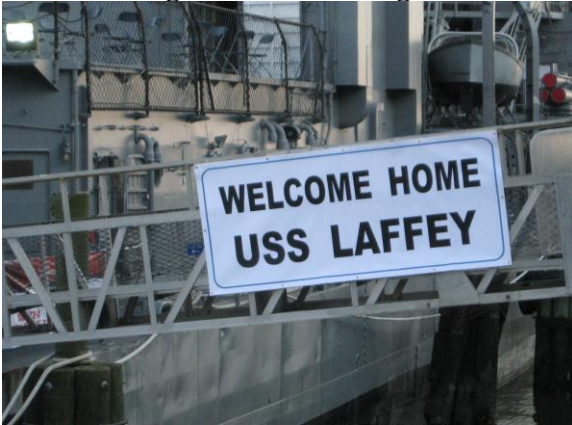
Now, isn't this just the nicest sign ever?!