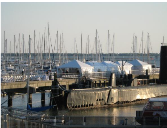
Tents filled with food and drinks