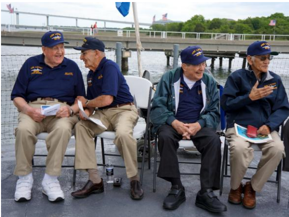
Our WWII weekend guests of honor