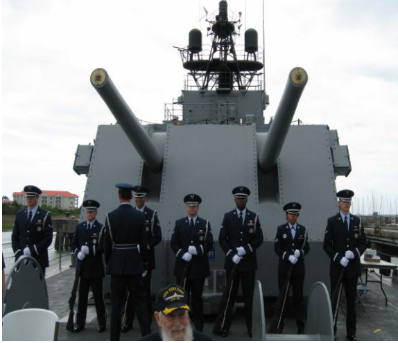
Charleston AFB Honor Guard