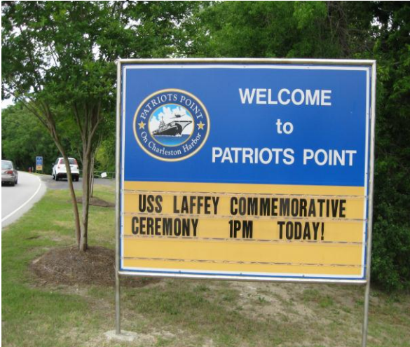
The final event of the celebration weekend