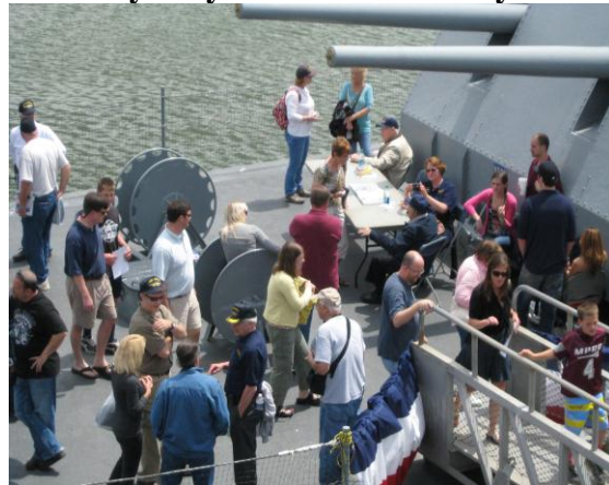
Typical of the all-day crowds