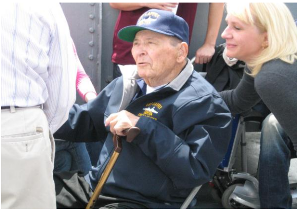
Let me tell you what really happened in 45!