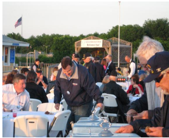
Let the party begin!