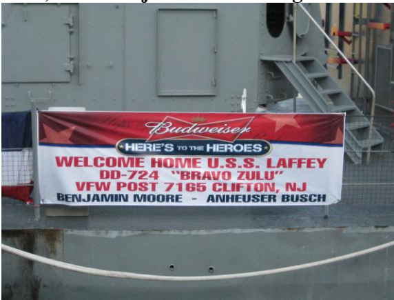
We'll drink to that!!