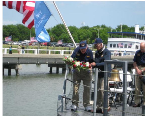
Casting of the Wreath of Remembrance