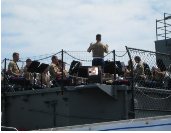
Marine Corps Band from Parris Island, SC