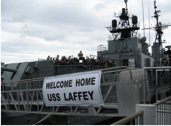
Historic ship returns to where she belongs