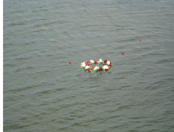
In Memory of Laffey's Lost at Okinawa