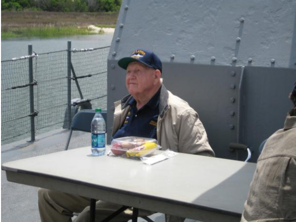
Don't they believe in lunch breaks?!