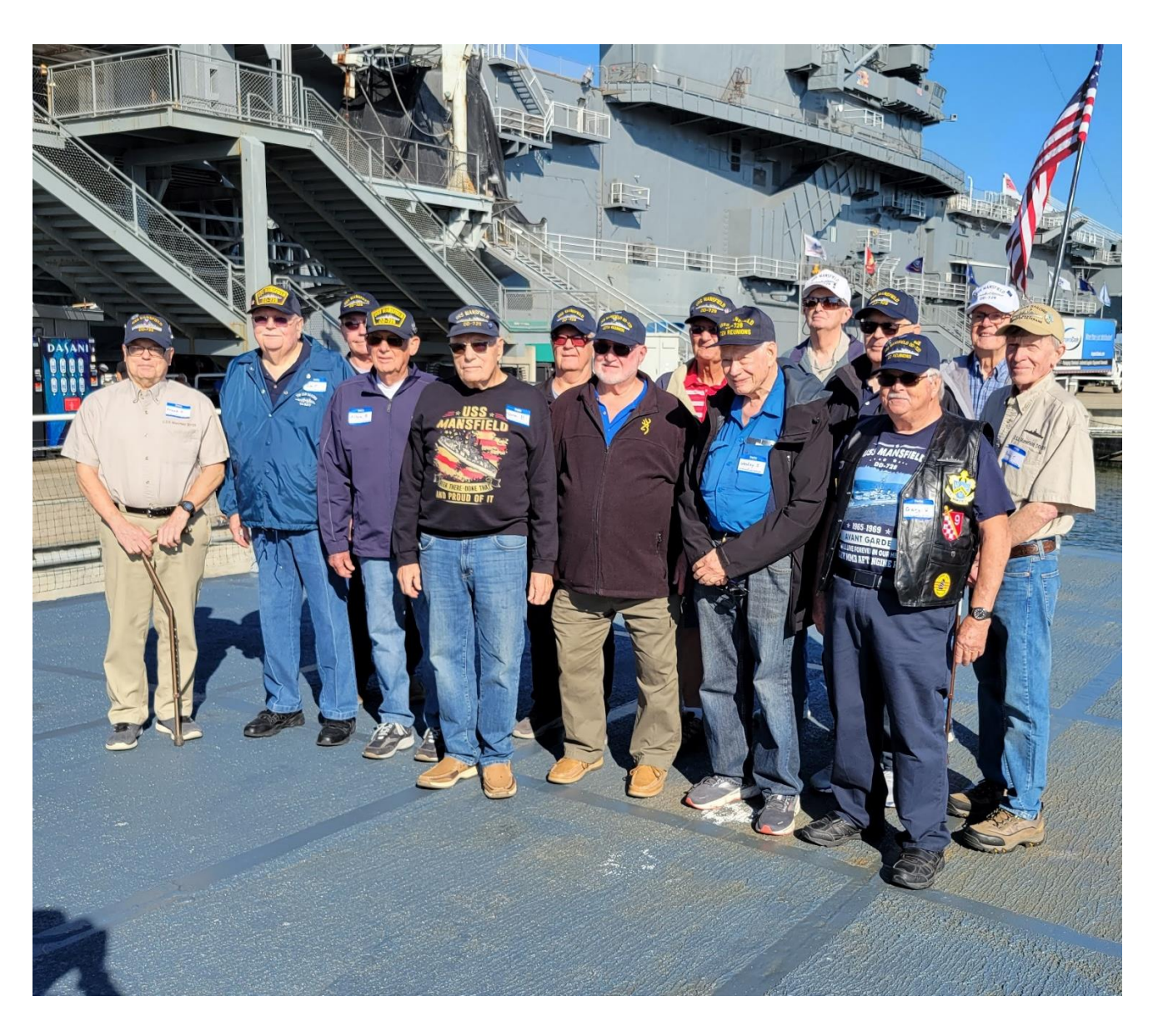
USS Mansfield Crew Members

Many photos <a href="https://www.ussmansfield.com/reunion-2023/">www.ussmansfield.com/reunion-2023/</a>