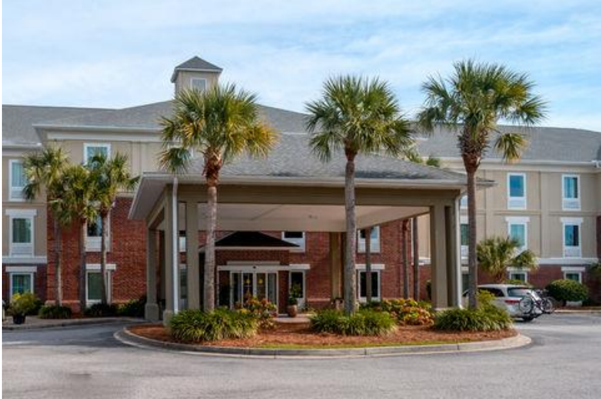
Comfort Inn & Suites, Patriots Point, 196 Patriots Point Rd, Mt Pleasant, SC 29464

Please make your room reservation online through this booking link,