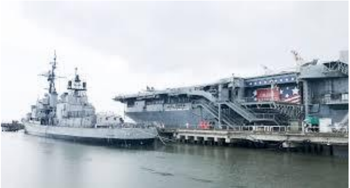
Farewell Dinner aboard USS Yorktown