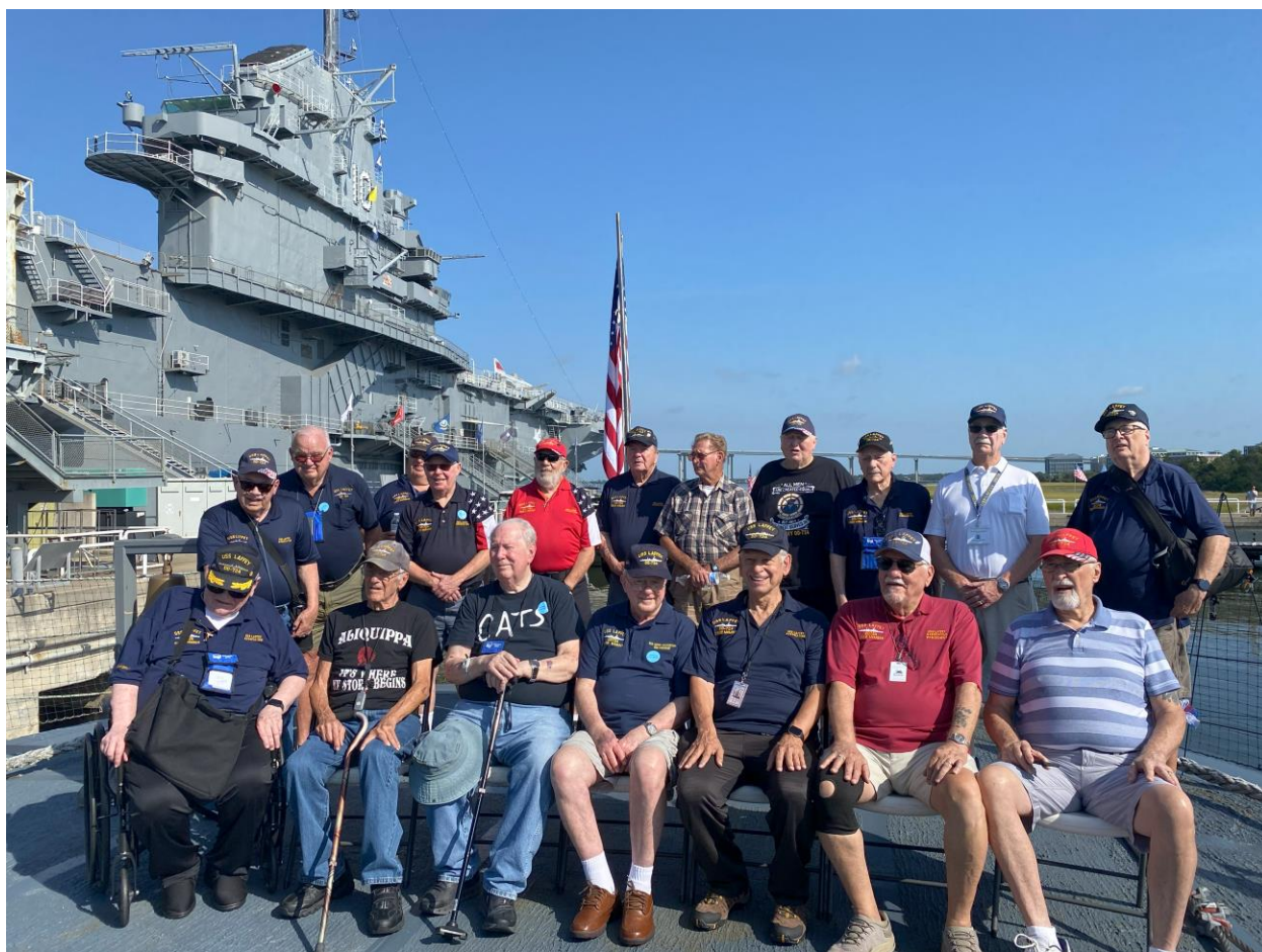
USS Laffey Crew Members at Memorial Ceremony

See photos from Jim Vickers, Patriots Point