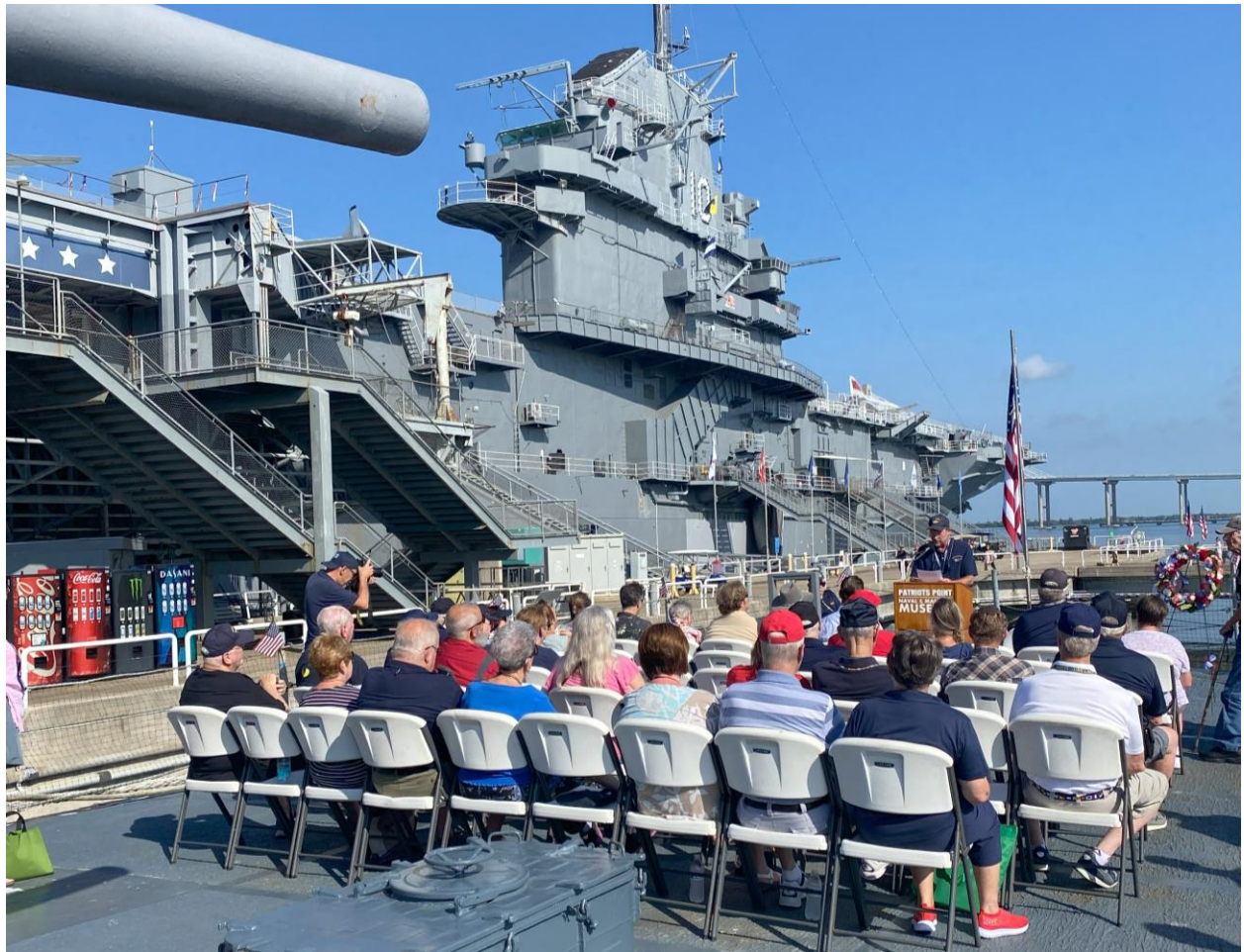
Memorial Ceremony on USS Laffey Fantail