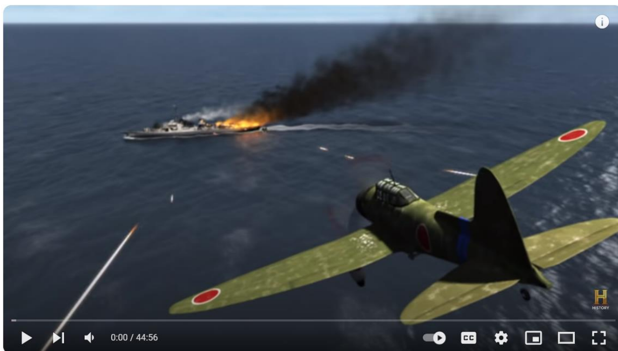
Dogfights: Japanese Kamikaze Attacks in WWII (S2, E1) | Full Episode | History