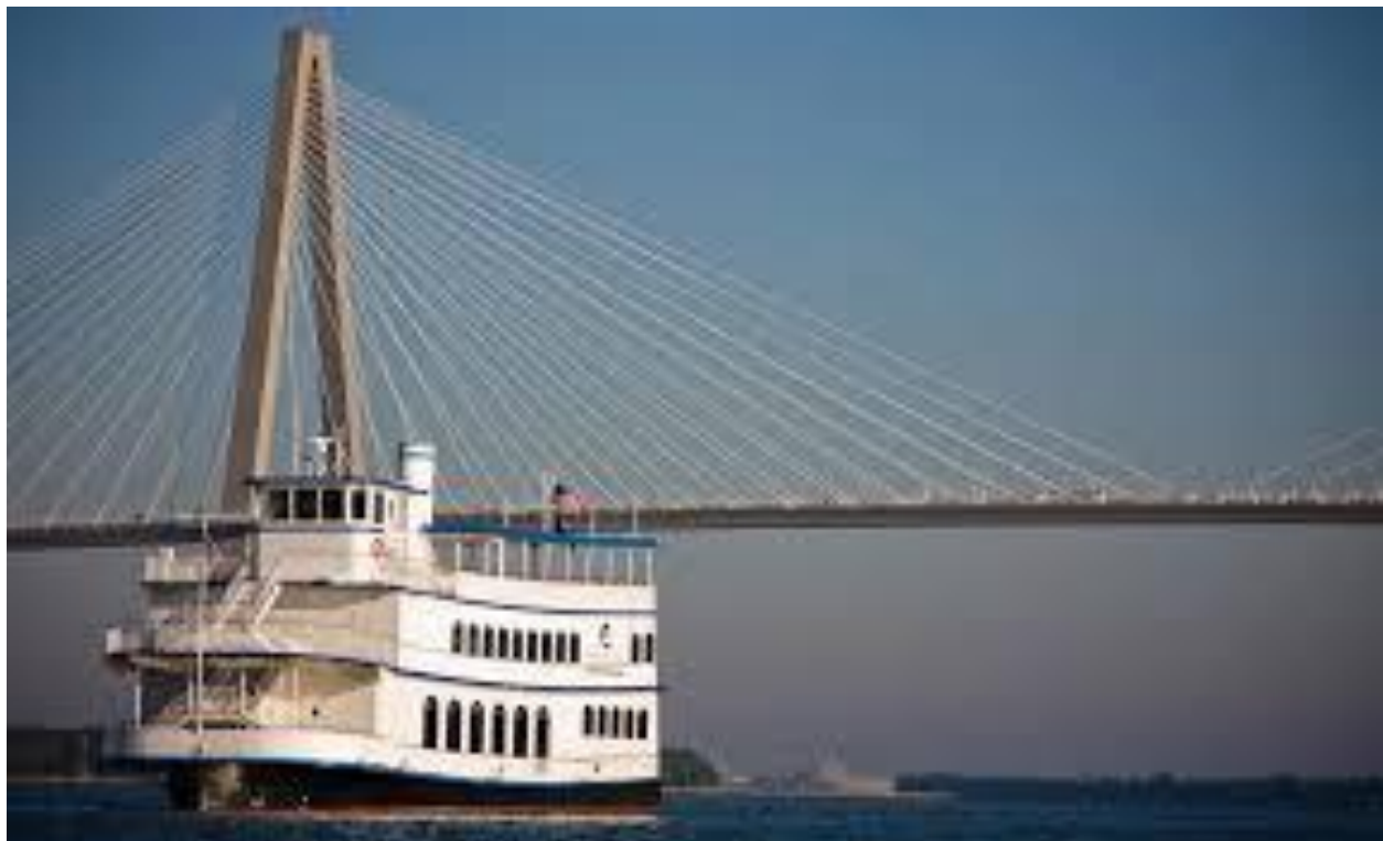
Spirit of Charleston Dinner Cruise