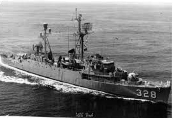
USS Finch DD 328