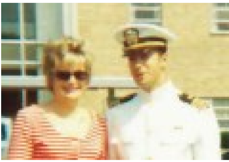
Ltjg Joseph Warren Finch (1920 – 1942)