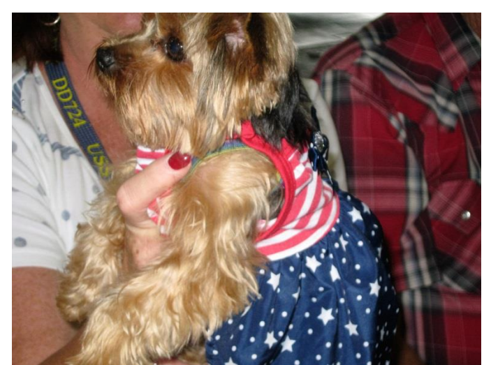
The patriotic pooch and the official puppy dog mascot of the USS Laffey DD-724 Association