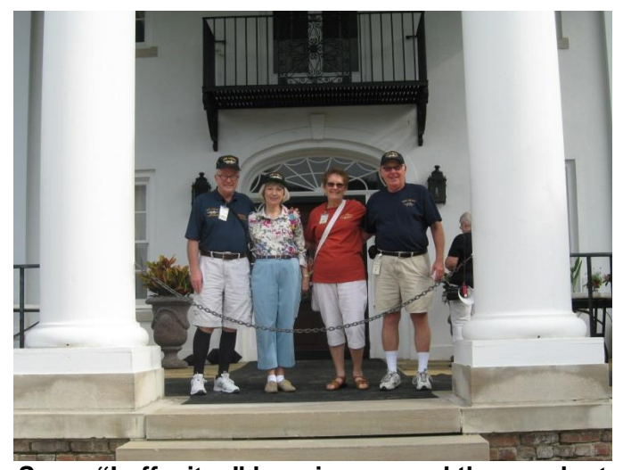
Some "Laffeyites" hanging around the porch at Boone Hall Plantation