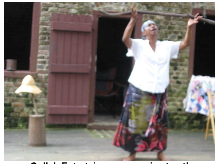
Gullah Entertainer – a genuine treat!