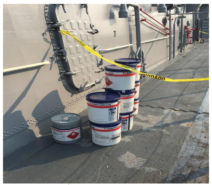
Approximately $3,000.00 of paint donated by International Paint Co.- Norfolk, VA. This is the second time they donated that amount of paint.