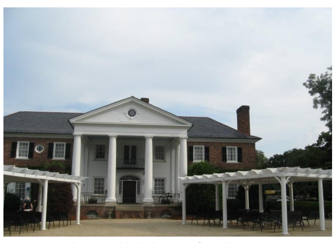
Boone Hall Plantation House