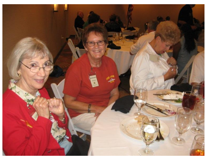
Hmmmm, I think I got a spot on my brand new blouse!!