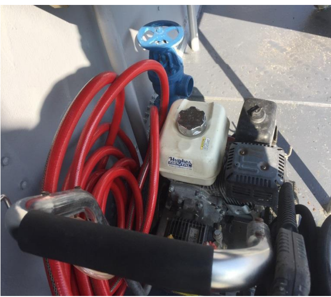
The power washer donated by Hughes Rental in Charleston. This is the second time they have donated the use of the power washer.