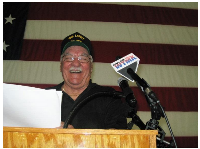
I don't know but he seemed to really enjoy his role as President...Must have been the pay!!