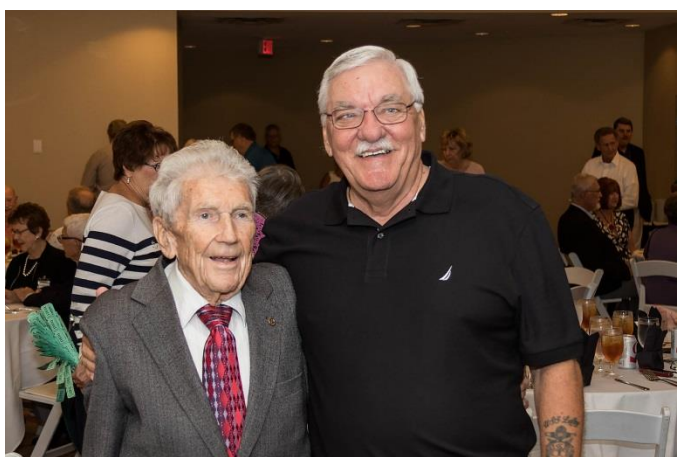
Two "old salts" reflecting and comparing their years of service onboard Laffey