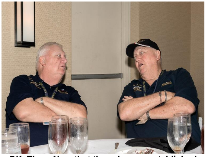
OK, Then. Now that the rules are established let's get ready to arm wrestle!