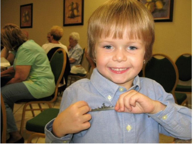
Someday.....Someday I'm going to become a US Navy sailor