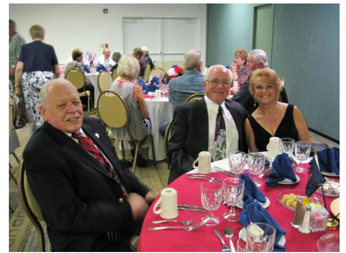
So tell me...When does the dinner buffet open?