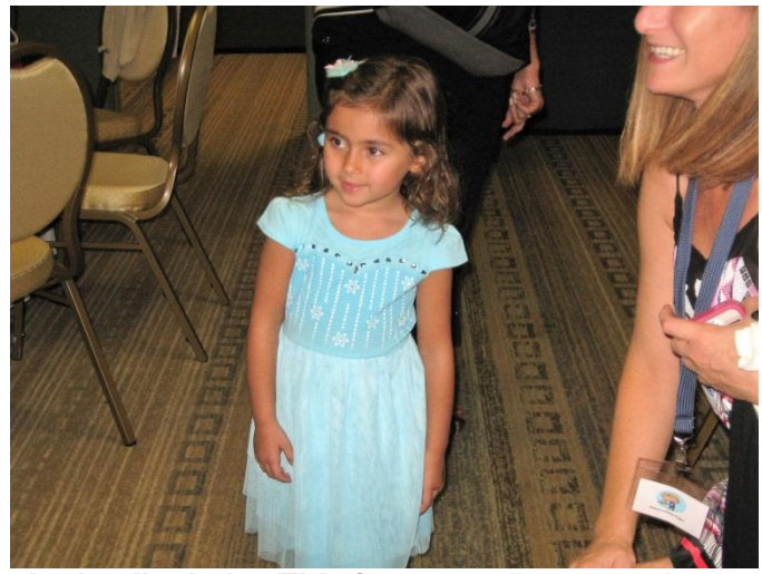
Let's all admit...This is one really pretty dress on one very pretty Laffey Reunion attendee!