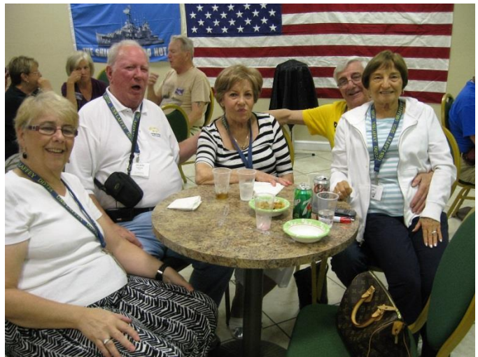
Are you aware there is someone in a yellow shirt hiding/lurking in the background?