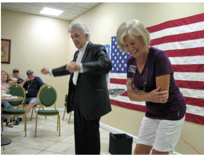
Now that was one funny joke!