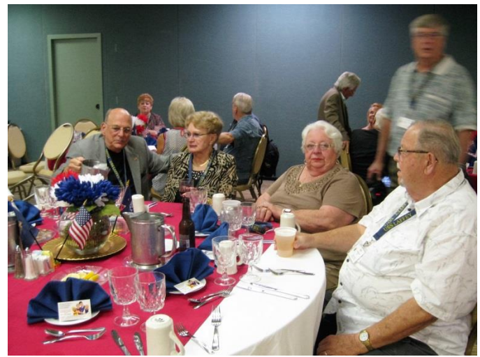
We've been waiting so very long to be called to the buffet line – Hope something will be left!!