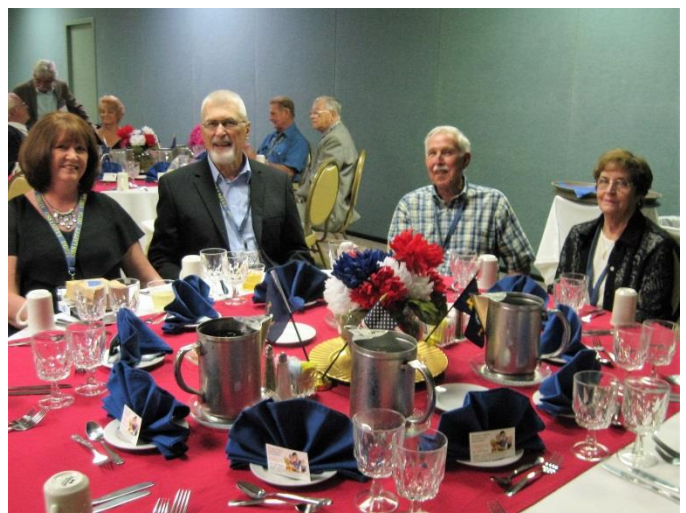
One, two, three.....Give us a smile!