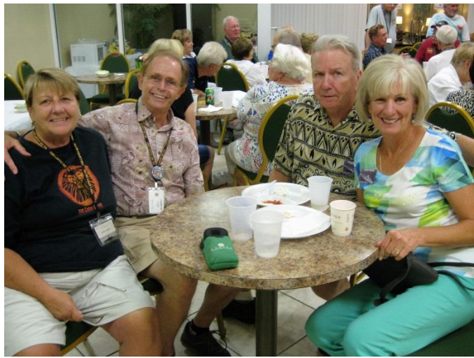
All together now......Smile!