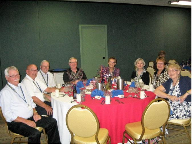
Looks like a USS Laffey family gathering to me!