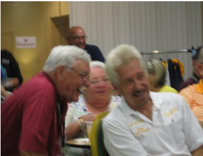
PPSSST – HAVE I GOT A GOOD JOKE FOR YOU!