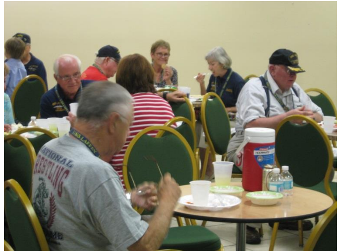
EAT, EAT...IS THAT ALL WE DO DURING THESE REUNIONS? NOPE – WE DRINK, TOO!!