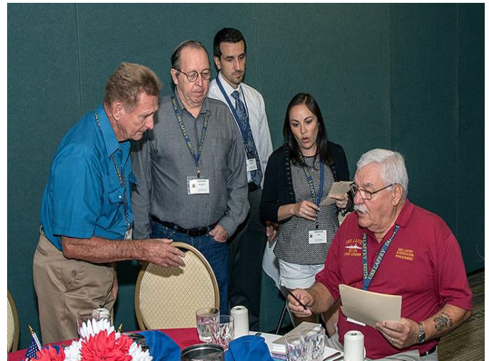
THIS IS TOUGH. DO ANY OF YOU HAVE A HAND HELD CALCULATOR?