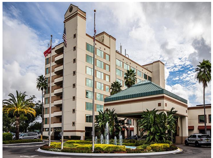
THE RAMADA GATEWAY, KISSIMMEE, FL HOST HOTEL FOR THE 2015 REUNION