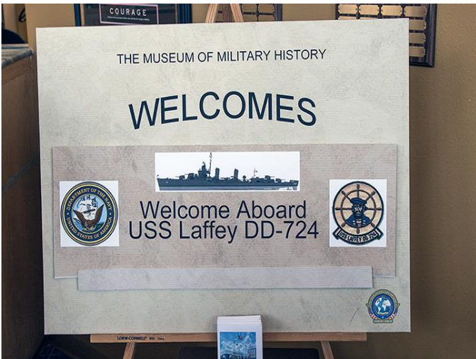
A NICE WELCOME TO THE MUSEUM!