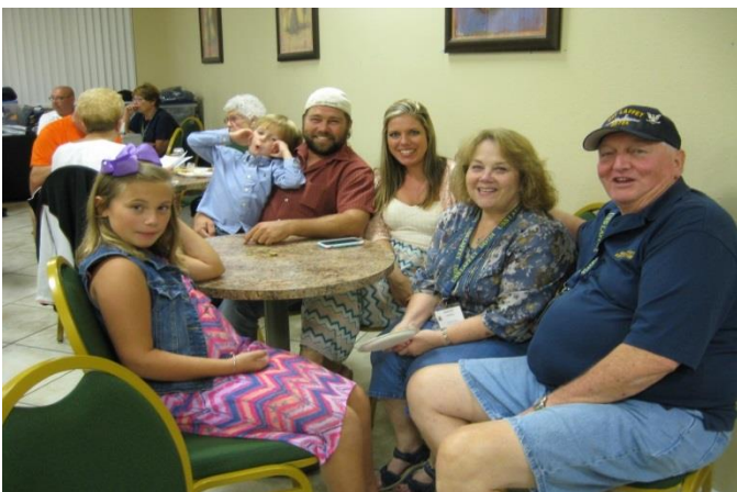
THE CAMPBELL FAMILY ATTENDED THIS YEAR'S REUNION IN ORLANDO, FL