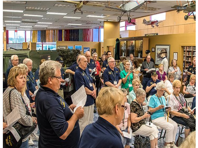
ATTENTIVE LAFFEY GROUP AT THE MUSEUM OF MILITARY HISTORY