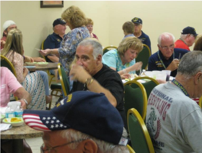
LET'S EAT BEFORE THE ENTERTAINMENT GETS STARTED!