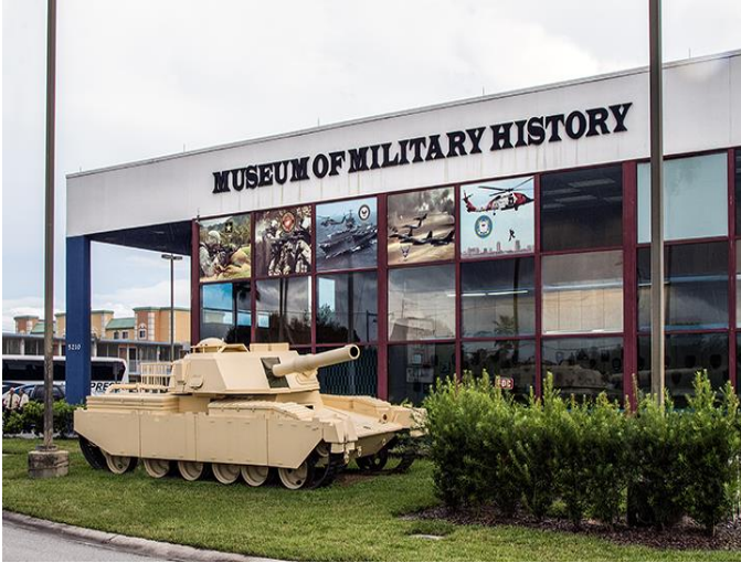
A VERY IMPRESSIVE COLLECTION INSIDE