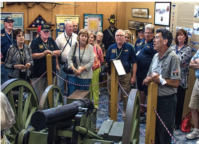
SO, WHO WANTS TO JOIN THE ARMY AND FIRE-UP ONE OF THESE BABIES?