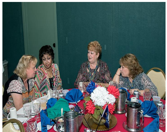
JUST TALK "AMONGST" YOURSELVES!