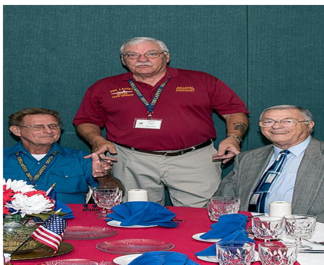
HONESTLY - IT WASN'T ME...ONE OF THESE GUYS DID IT!