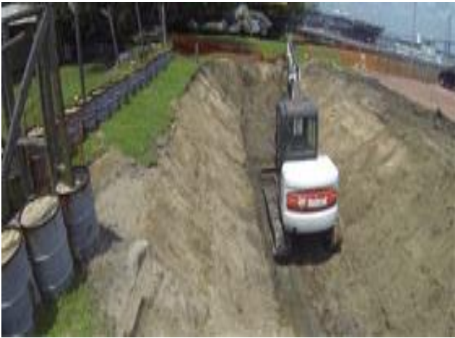
Construction Underway on the Vietnam Exhibit Expansion

Construction has begun on the expansion of the Vietnam Experience, opening Veterans Day 2014. When completed, the exhibit will include a US Marine Corps Artillery Firebase and a Brown Water Naval Support Base. The Town of Mt. Pleasant is also building a new lagoon for a MK1 River Patrol Boat.