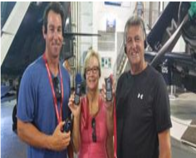
New Audio Tour Available on the USS Yorktown

Construction has begun on the expansion of the Vietnam Experience, opening Veterans Day 2014. When completed, the exhibit will include a US Marine Corps Artillery Firebase and a Brown Water Naval Support Base. The Town of Mt. Pleasant is also building a new lagoon for a MK1 River Patrol Boat.