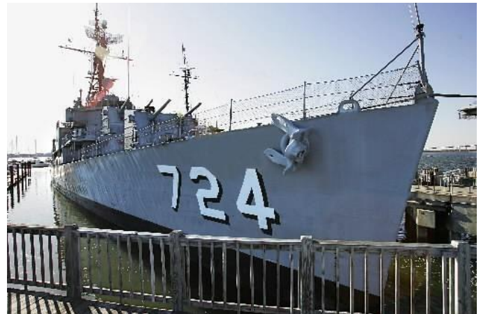
SHE MAY BE OLD, BUT SHE SURE IS PRETTY!