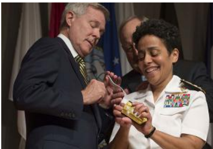
Navy News | Jul 01, 2014

ARLINGTON, Va. -- The United States Navy promoted Michelle Janine Howard to the rank of four-star admiral July 1 during a ceremony at the Women in Military Service for America Memorial at Arlington National Cemetery.