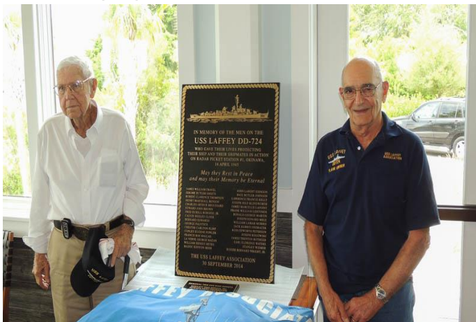
Please note the memorial plaque