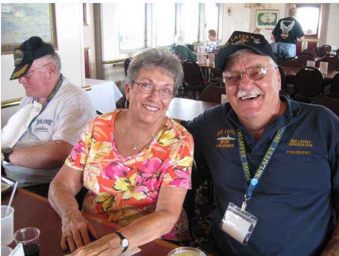
Sonny and Cher Enjoy a Lighter Moment