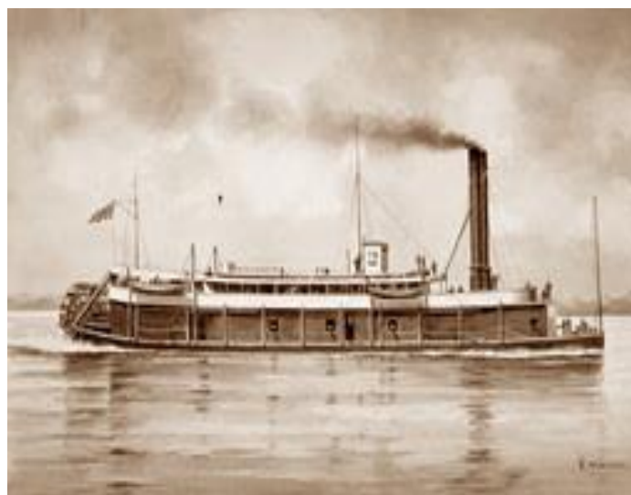
THE USS MARMORA