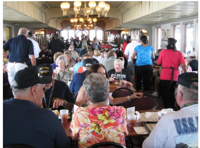
Dining Aboard the Steamboat Natchez