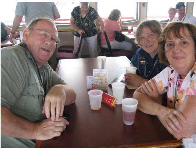
The reunion's really hard workers at rest