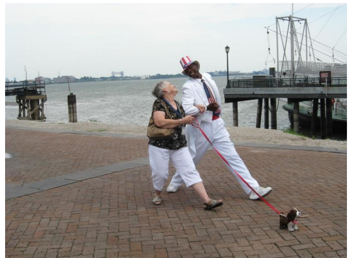
Just taking the puppy dog for a walk!