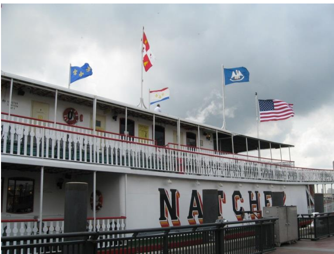
Our "cruise ship"...The Riverboat Natchez