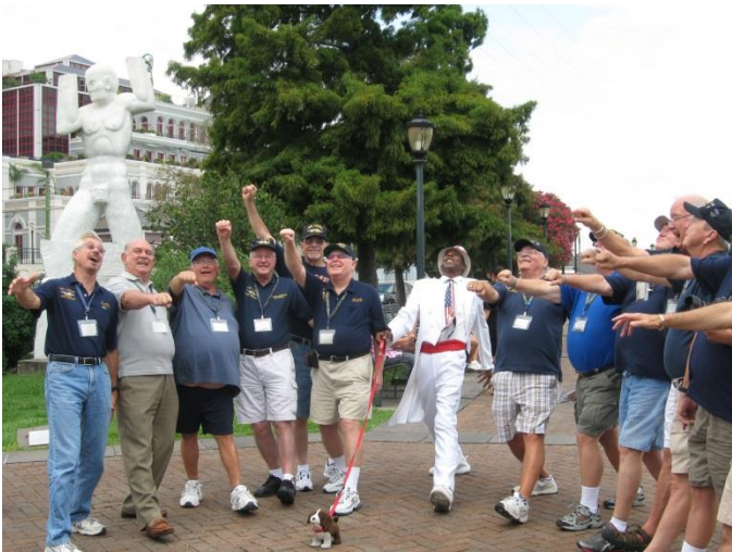
Who are these guys and what are they doing?