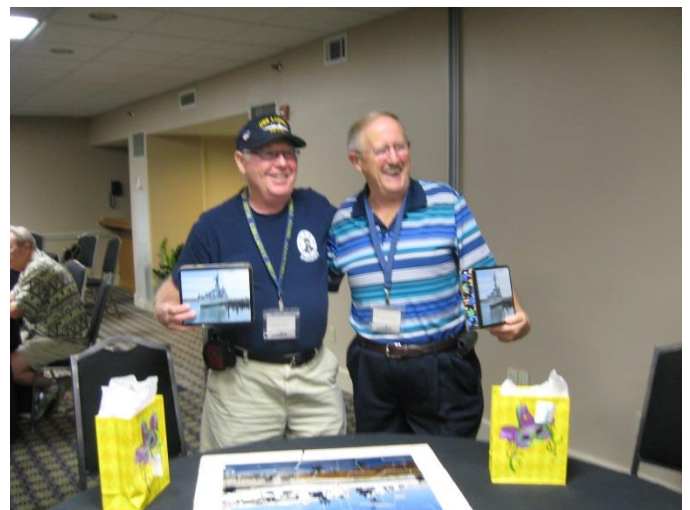
The great puzzle contest victors – Well done!