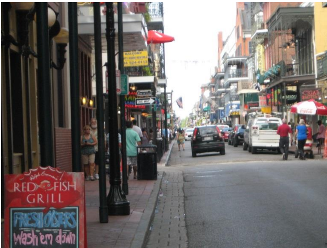
Bourbon Street by day...Not the same at Night!!