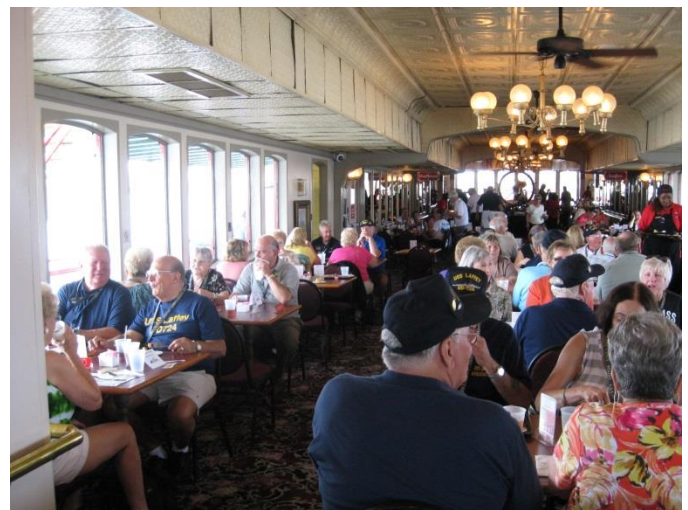
We filled the deck with "Laffey Diners"