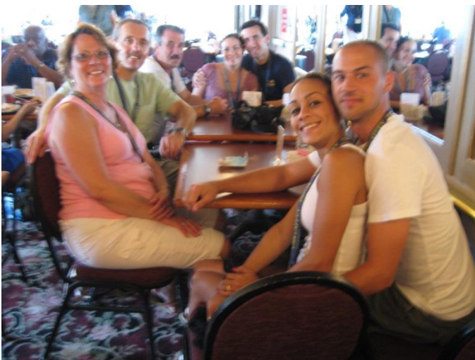
The Essig Family enjoys our reunion...again!