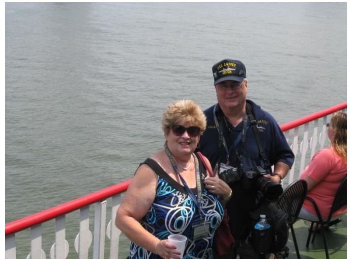
Listen up – I'm the official Laffey photographer!