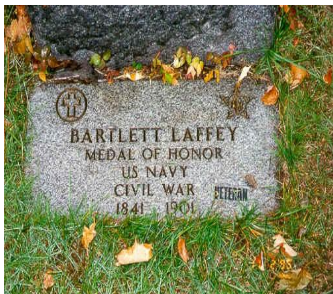
SEAMAN LAFFEY'S GRAVE MARKER