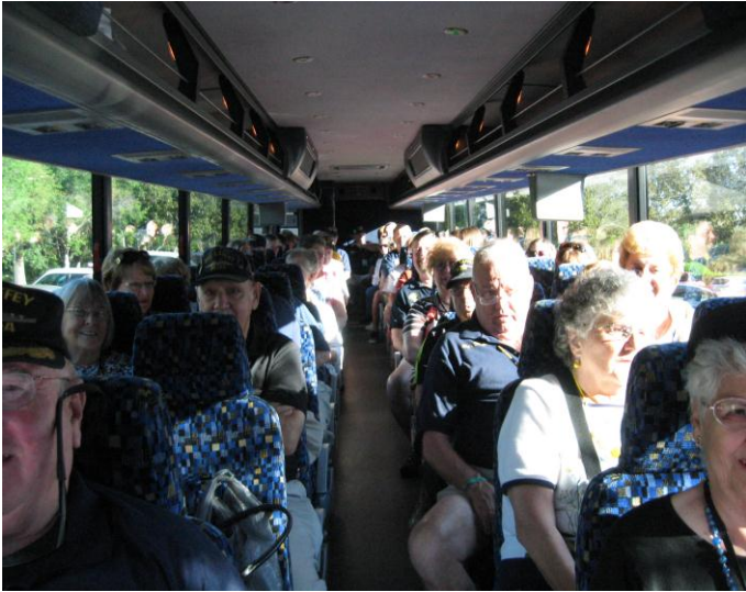
Bus trip to visit the submarine Hunley