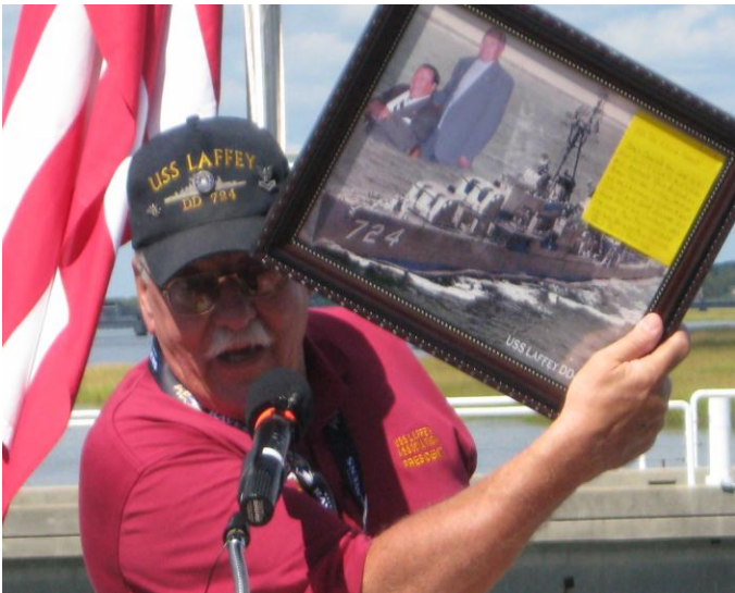
The Picture Said it All!