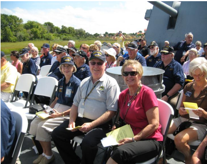
Part of the crowd at the memorial ceremony