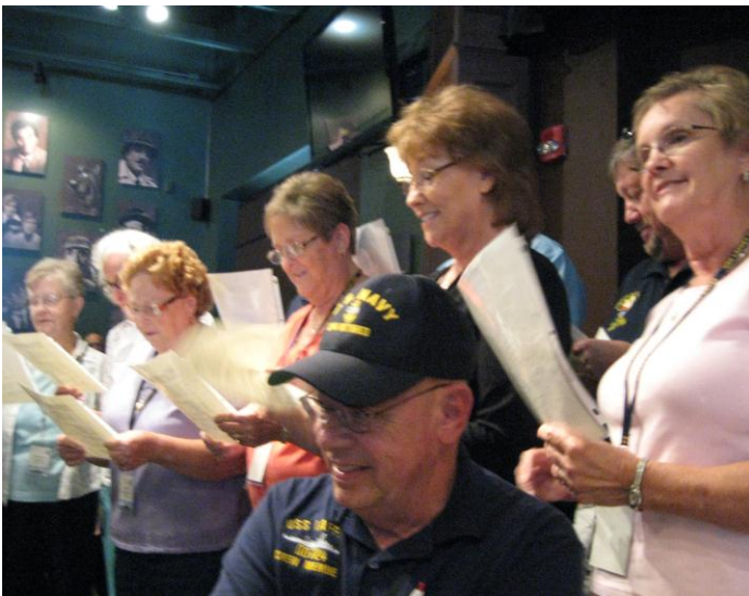
The Laffey's Lennon Sisters?