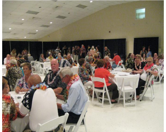
Just a portion of the Luau Attendees