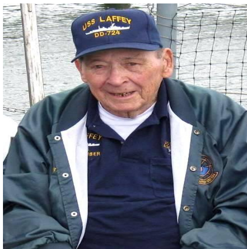
May 27, 1924 - August 6, 2012