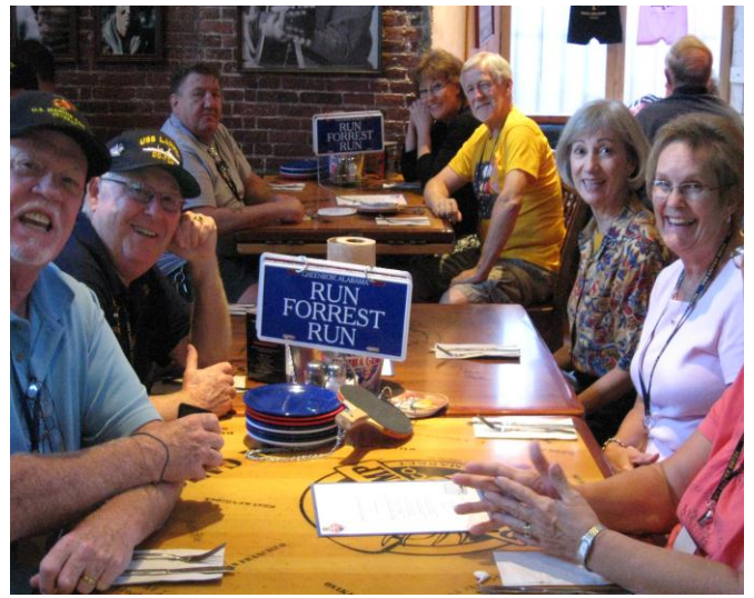
Food.....Bring Food.....Hurry – Feed Us!!