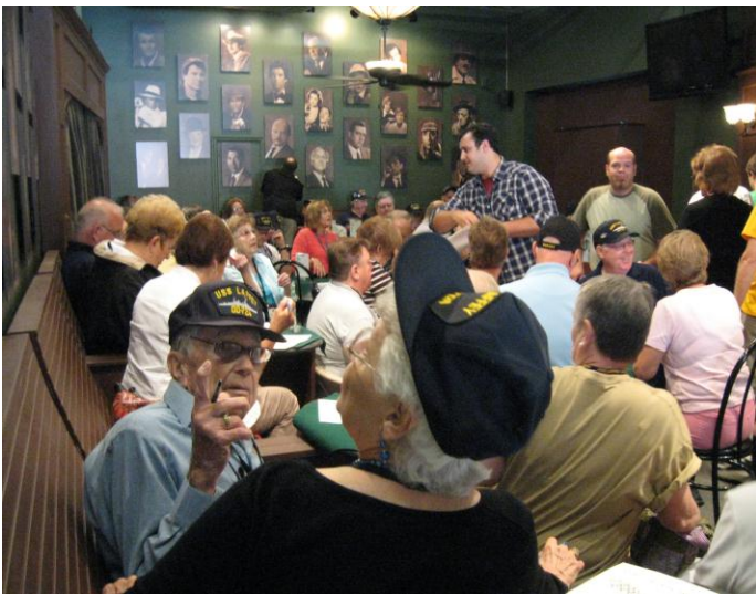
The mystery show and sing-a-long