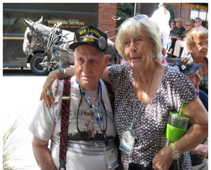
Just a couple of old pals hanging around