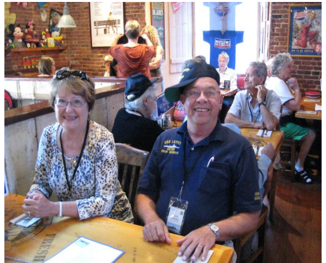
How did this guy get into Bubba Gump's?