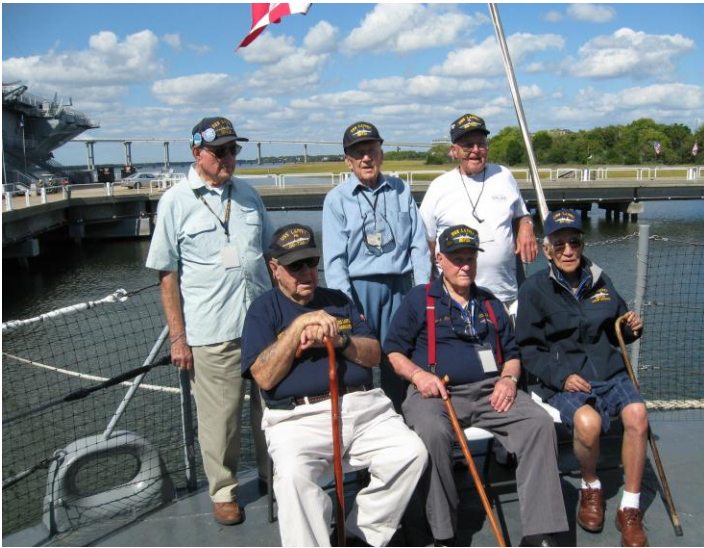
Let's get this ceremony underway!!