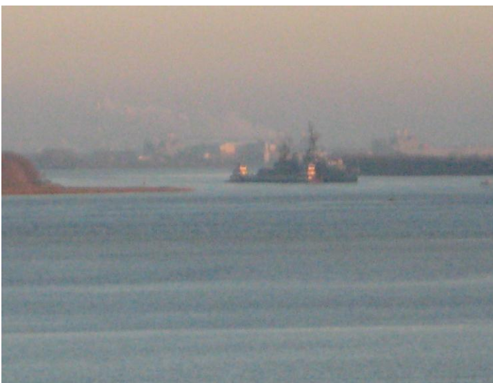
First View - Laffey first appears in the distance