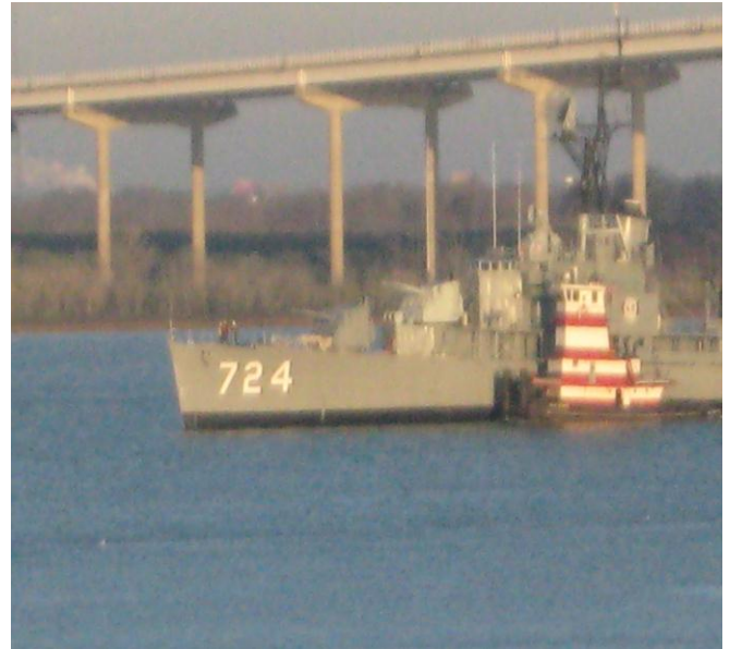
Laffey passes under bridge on way to new home