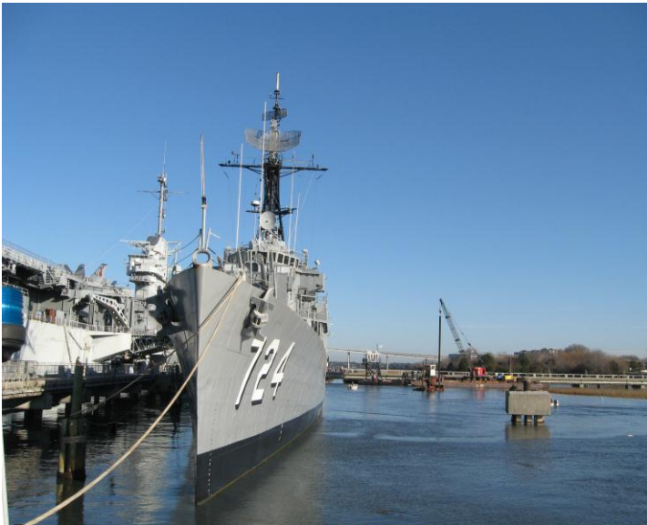
From this angle we look larger than Yorktown!