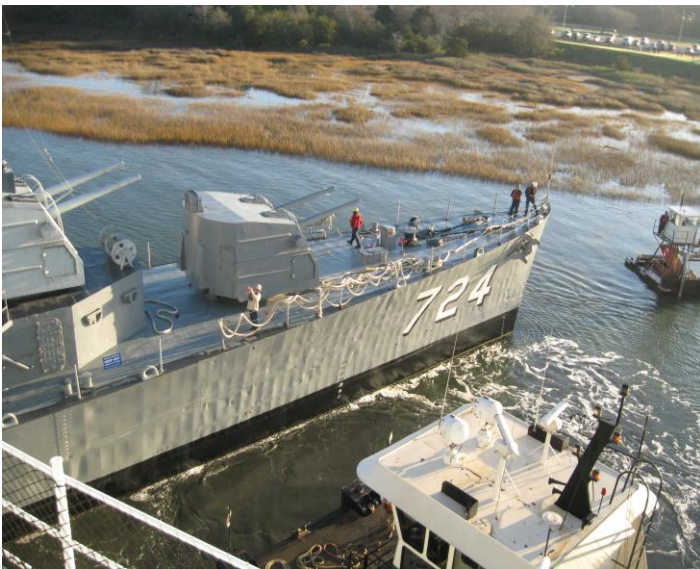
Just a few more pushes and pulls!!