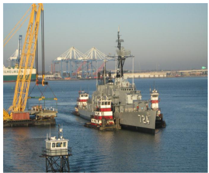
Passing crane holding removed pier section