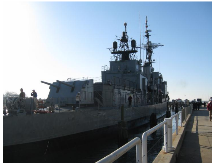
Home at last....Home at last!