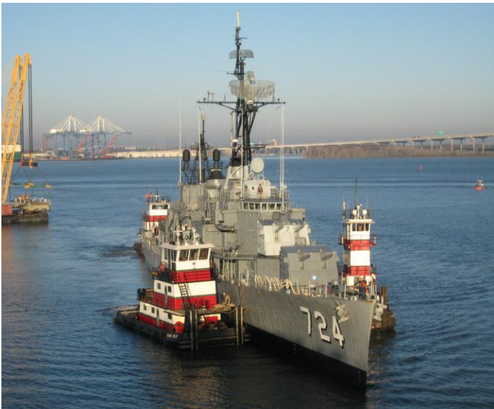
On the way to a tight turn