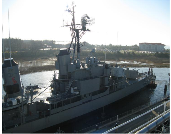
OK Now...Let's get those line handlers ready