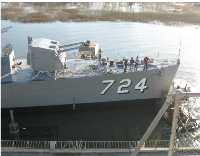
Getting closer inch by inch - We'll be home soon!