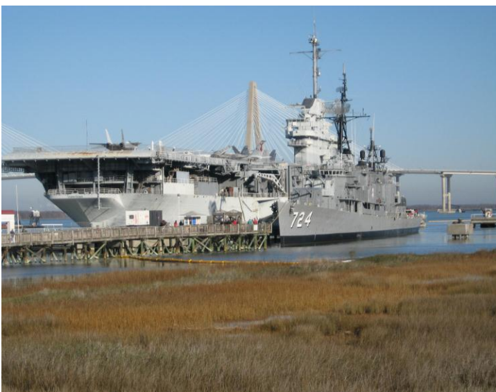
Reality view – The carrier Yorktown is bigger!