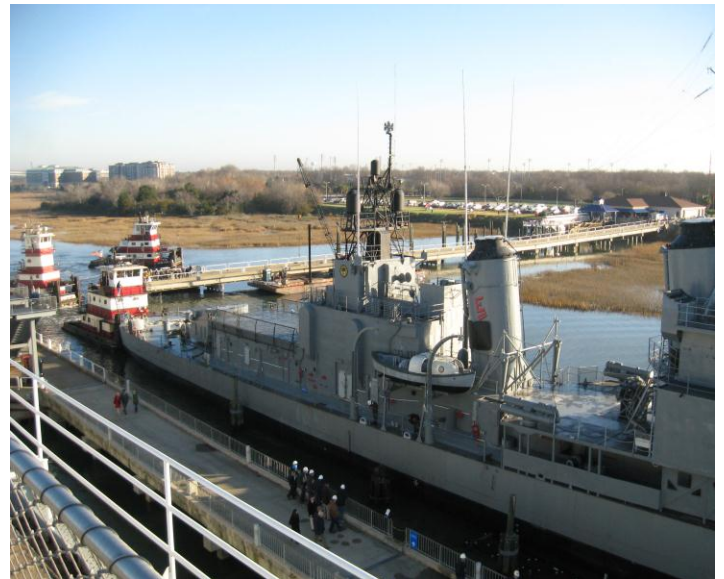
We made it through the 60' pier opening