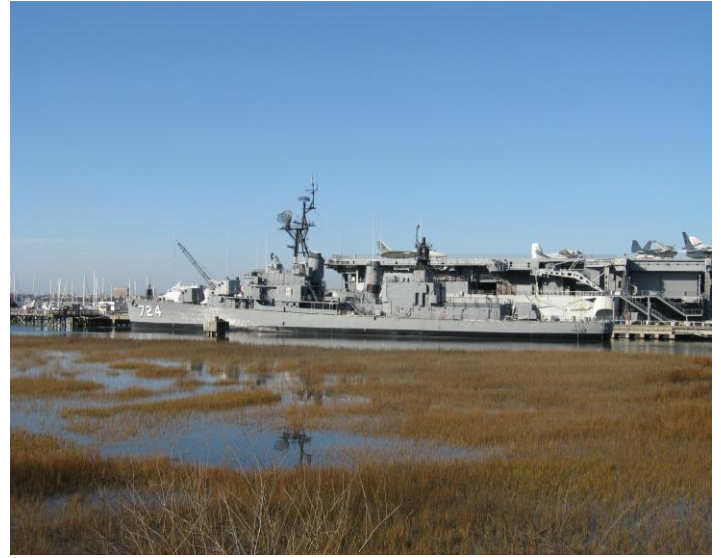
View of Laffey from entrance pier. Very Visible!