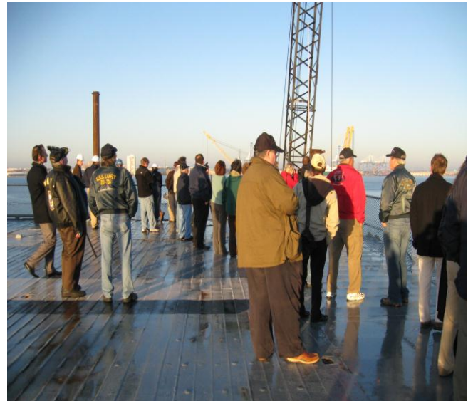
Crowd begins to assemble on carrier Yorktown