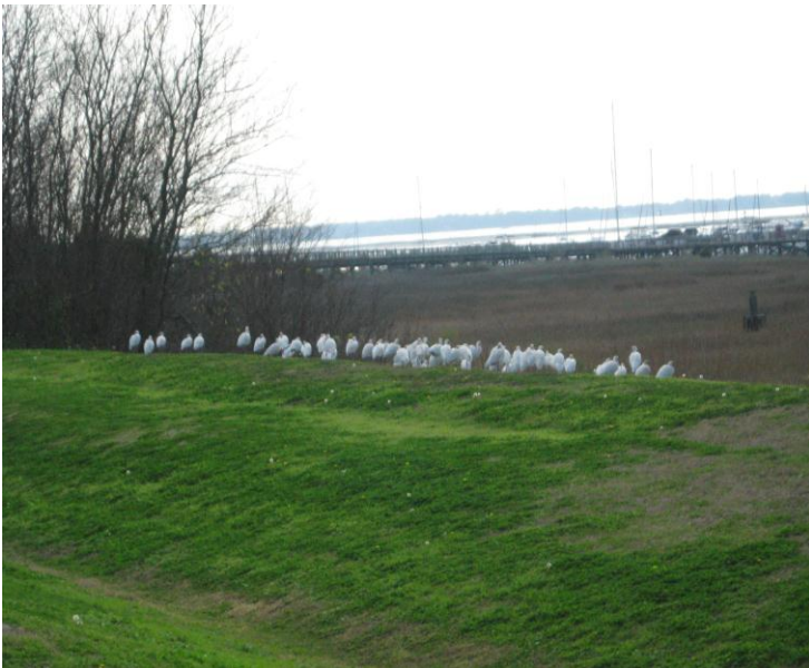
White Ibis flock gathers to await the Laffey