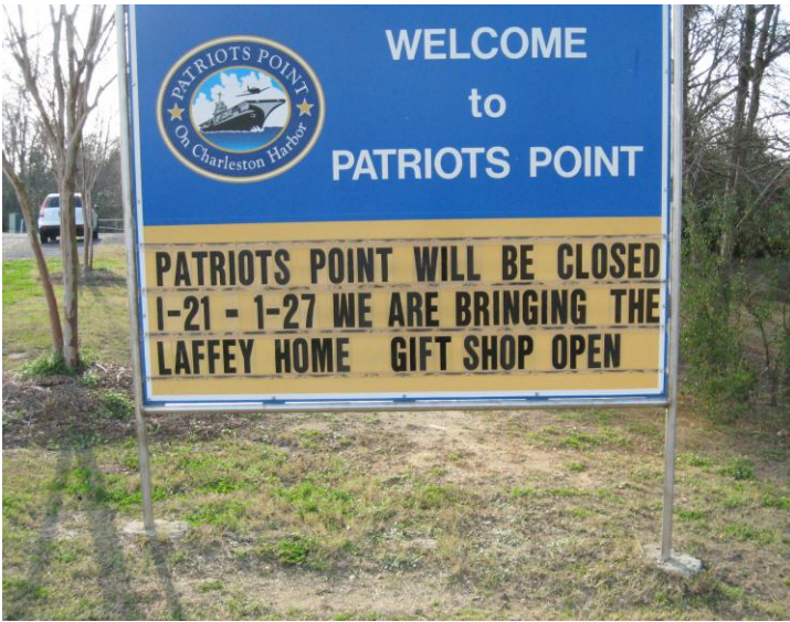
Now isn't this just one great sign