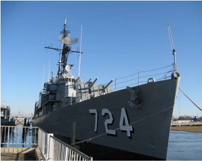
The Ship That Would Not Die.....Lives!