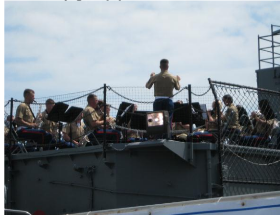
Marine Corps Band from Parris Island, SC