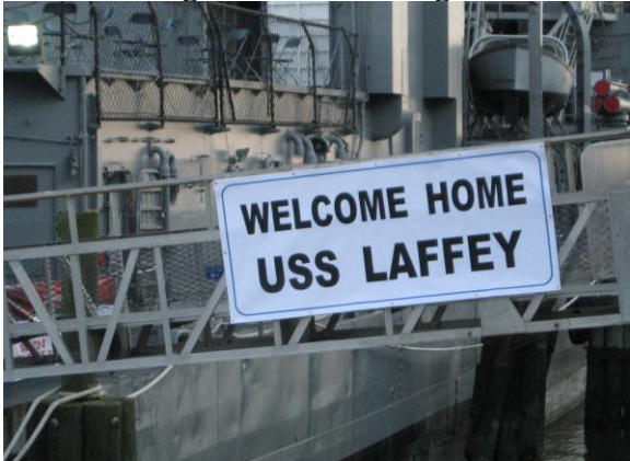
Now, isn't this just the nicest sign ever?!