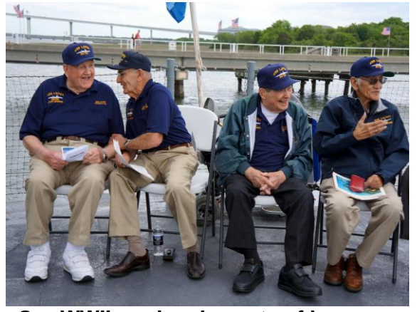
Our WWII weekend guests of honor