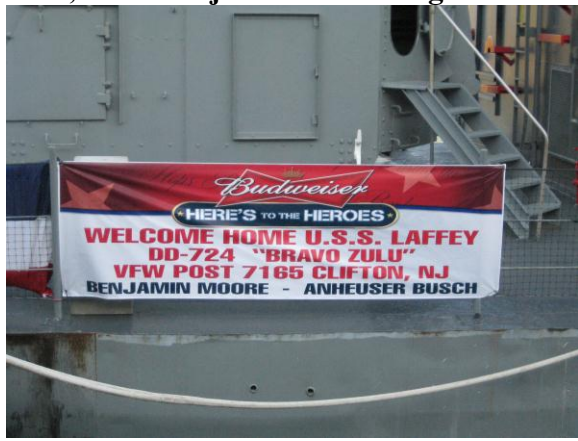
We'll drink to that!!