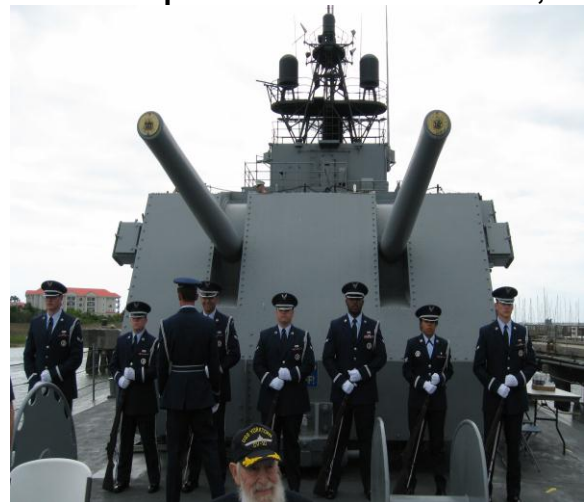
Charleston AFB Honor Guard