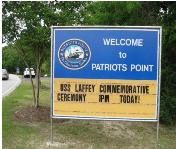
The final event of the celebration weekend