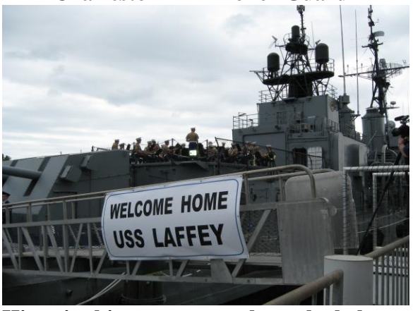
Historic ship returns to where she belongs