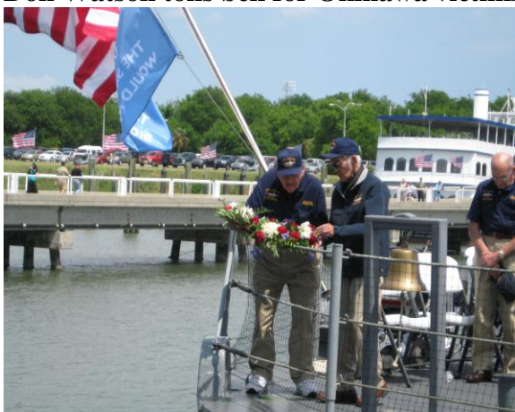
Casting of the Wreath of Remembrance