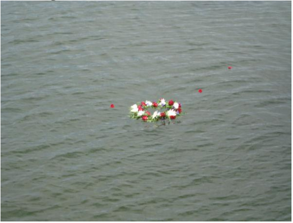
In Memory of Laffey's Lost at Okinawa