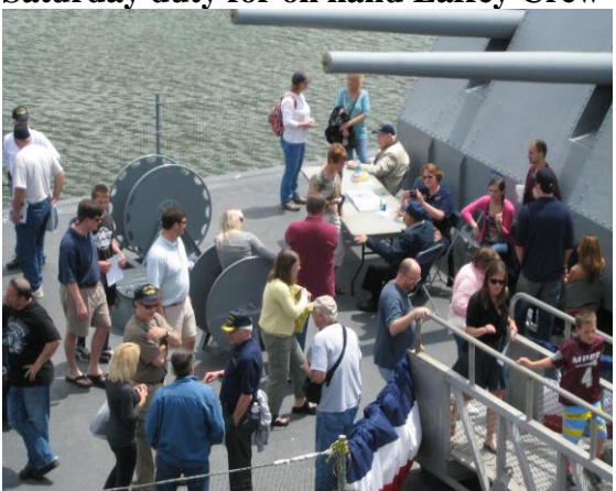
Typical of the all-day crowds