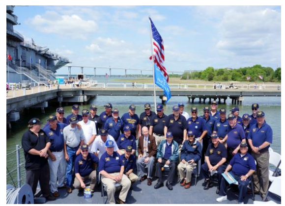
Laffey group photo on the fantail