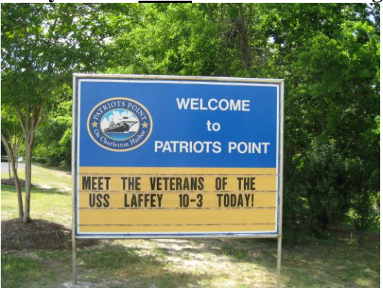
Saturday duty for on hand Laffey Crew