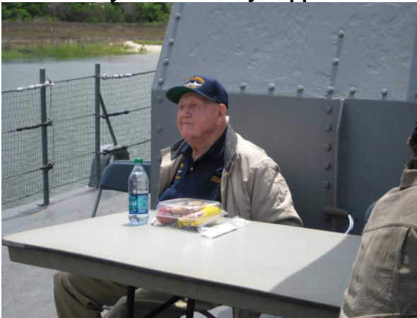
Don't they believe in lunch breaks?!