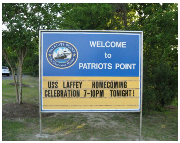
Welcome sign for the evening celebration