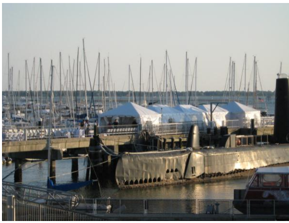
Tents filled with food and drinks